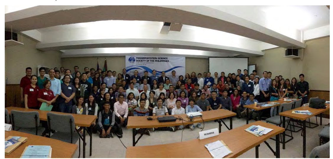
TSSP 23<sup>rd</sup> Annual Conference Participants

Corporate members of TSSP represented in the conference include Manila North Tollways Corporation, Tollways Management Corporation, Almec Corporation, Parsons Brinckerhoff, Abratique & Associates, PLANADES and UPNCTSFI.