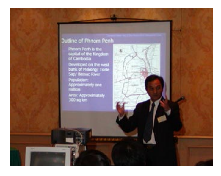
Special Session for Cambodia