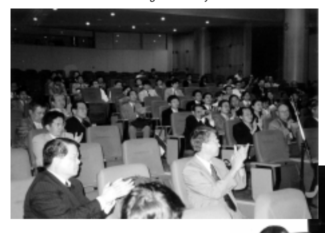
Scenes from EASTS 1999 in Taipei