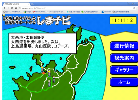
Figure 6. The example of a display of the position information on the bus under development

The example of a display of the position information on the bus under development is shown in Figure 6.