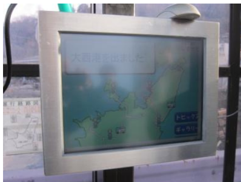
Figure 2. A touch panel terminals installed at the bus stop

In this system, a touch-panel terminal is installed in the ferry terminal, a public office, a supermarket, a hospital, etc. The main functions are described below. A touch panel terminals installed at the bus stop is shown Figure 2. A touch panel terminals installed at the ferry terminal is shown Figure 3.