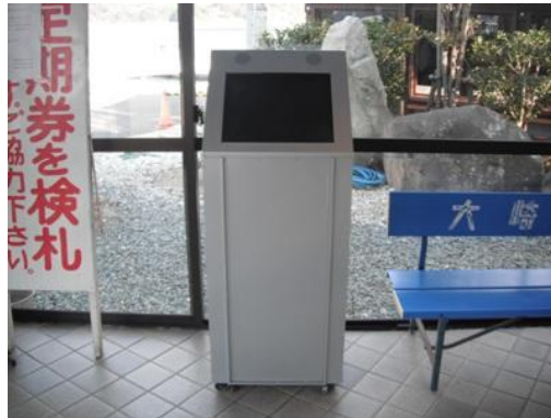
Figure 3. A touch panel terminals installed at the ferry terminal