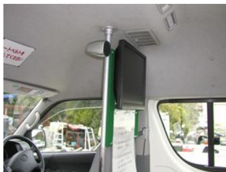
Figure 4. An electronic bulletin board installed in Otohime bus

An electronic bulletin board is carried in bus(Sanyo bus and Otohime bus) services on the island and the ferry. An electronic bulletin board installed in bus is shown Figure 4.