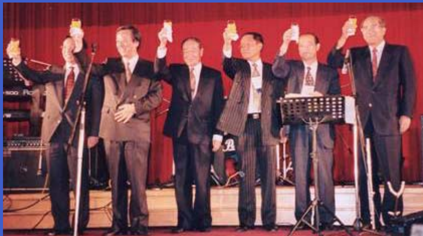
3rd Conference in Taipei, 1999