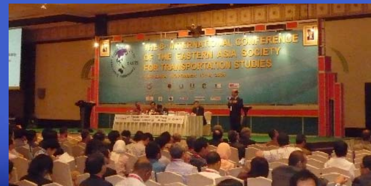
8th Conference in Surabaya, 2009 11