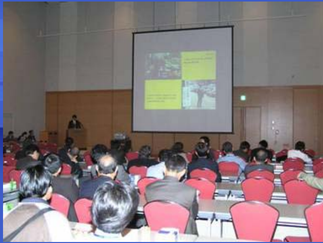
5th Conference in Fukuoka, 2003