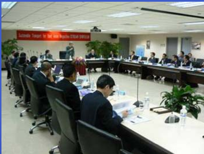
Taipei Workshop (March, 2006)

Hong Kong, Japan, Korea, Philippines, Taiwan, and Thailand