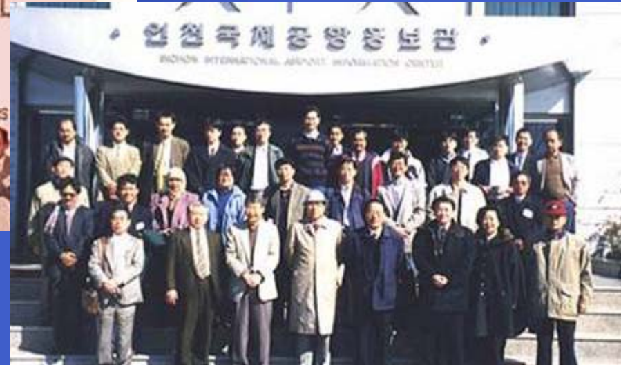
2nd Conference in Seoul 1997