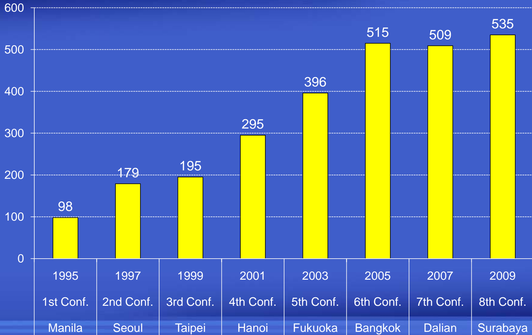
Number of Technical Papers of the Conference