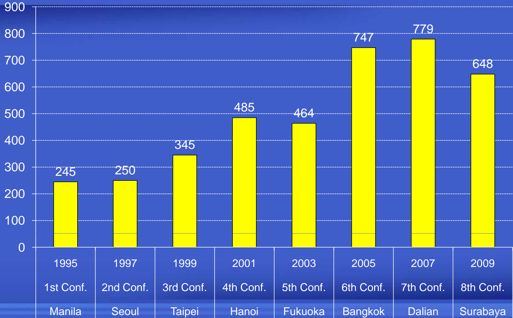
Number of Participants to the Conference