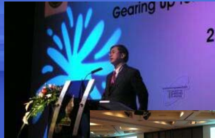
6th Conference in Bangkok, 2005