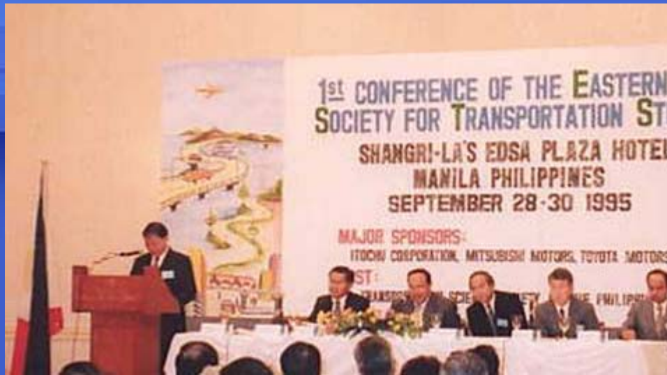
1st Conference in Manila, 1995