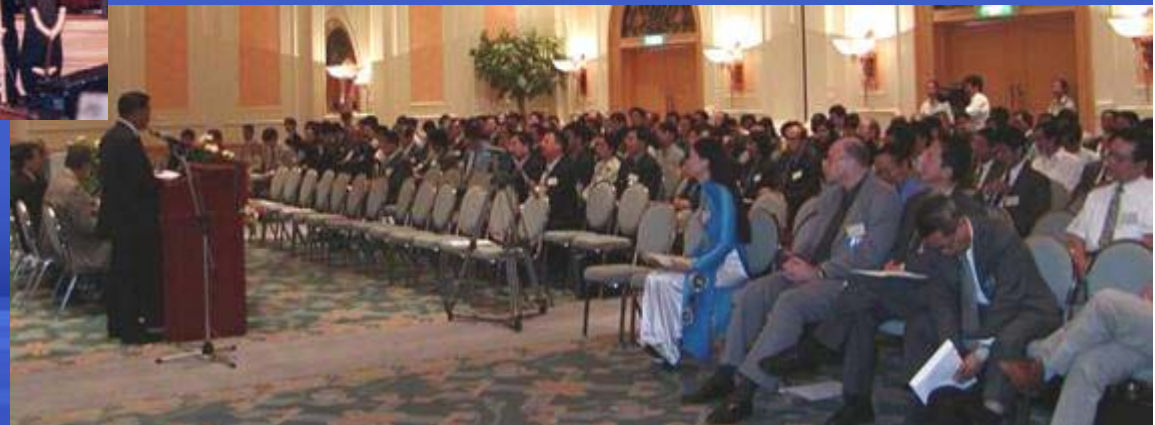
4th Conference in Hanoi, 2001