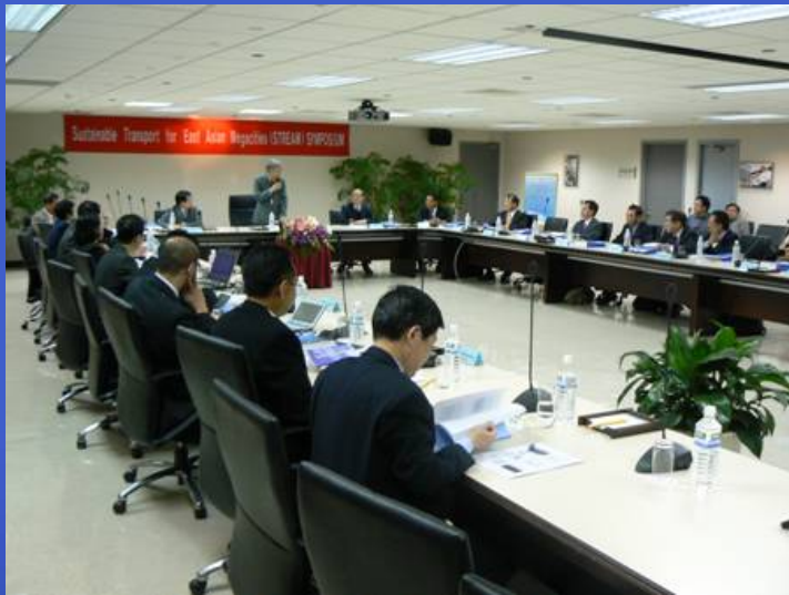
Taipei Workshop (March, 2006)

Hong Kong, Japan, Korea, Philippines, Taiwan, and Thailand